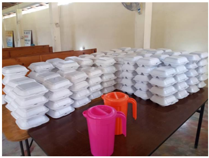
November 15, 2021 church anniversary meal