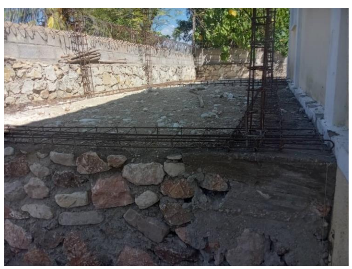
December 05, 2021, new restrooms beside church.